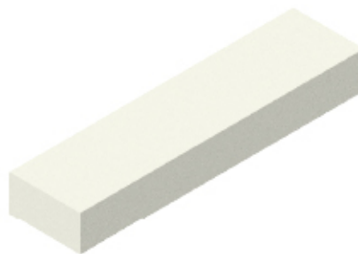
Sharpening Stone FORM 9010 25x13x100 EKW 500/5 I 7/8 V5901Z ID 210387