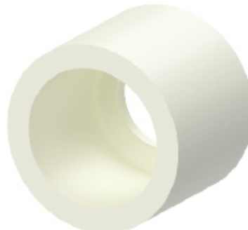
Sharpening Cup FORM 6 120x95x60,33 - W15xE10 SCG 220/4 M 7/8 V7500Z ID 203044