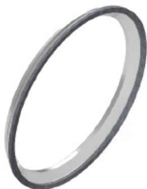
Diamond Cupwheel 6A2-350-15-7-EPx-D12-TS Bore: 310H6 ID 215951 (NA) und 206328 (WB)