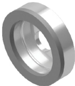
Diamond Cupwheel 6A2-150-20-10-EPx-D10-TB Bore: 40H7 ID 214761